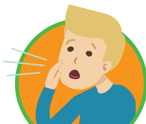
COUGH OR COLD